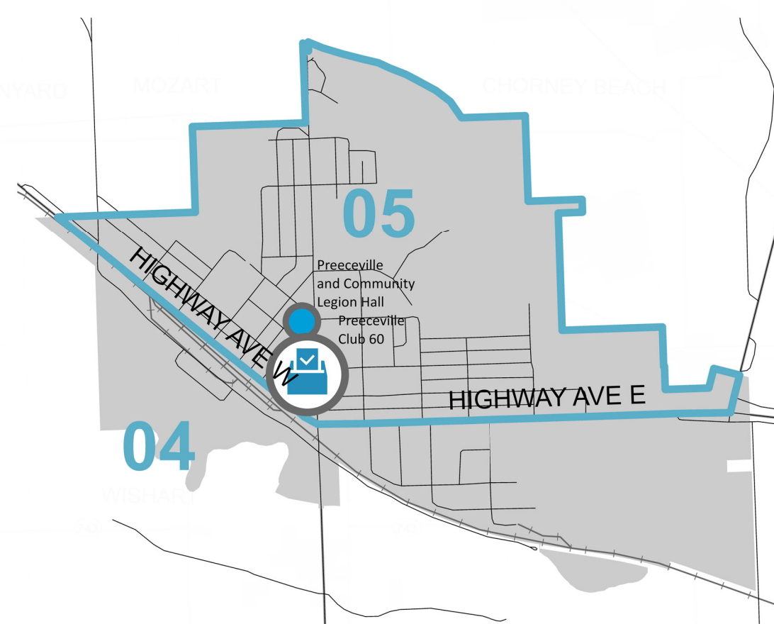
Town of Preeceville Inset Polling Divisions 04 and 05