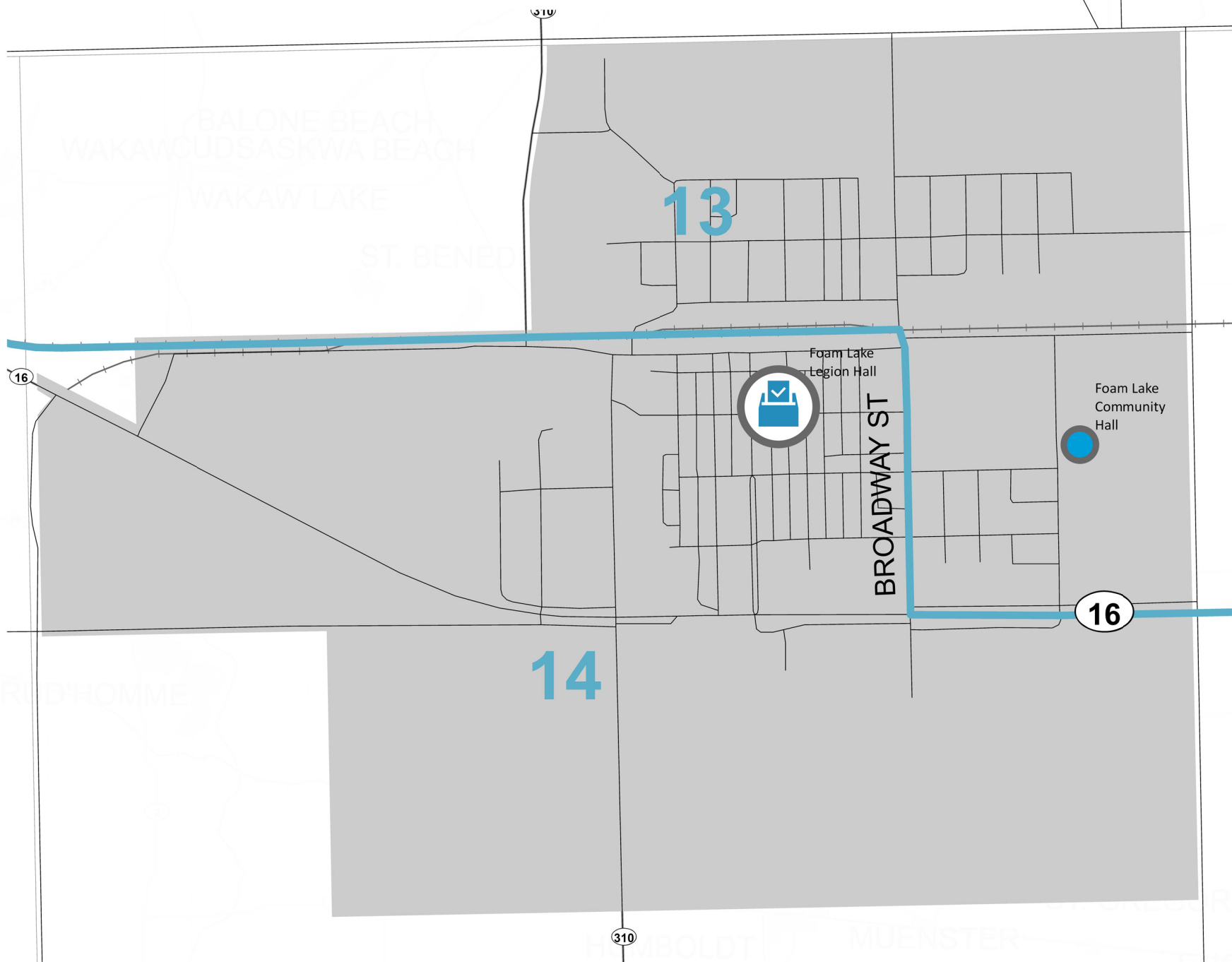
Town of Foam Lake Inset Polling Divisions 13 and 14