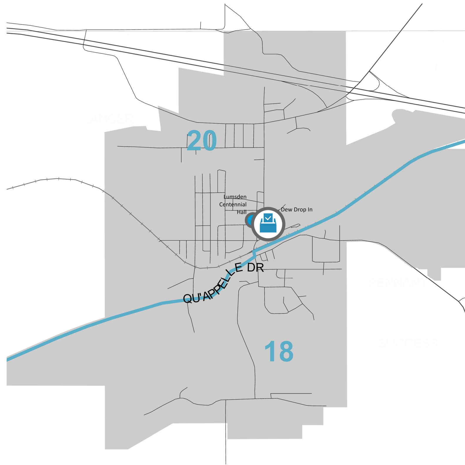
Town of Lumsden Inset Polling Divisions 18 and 20